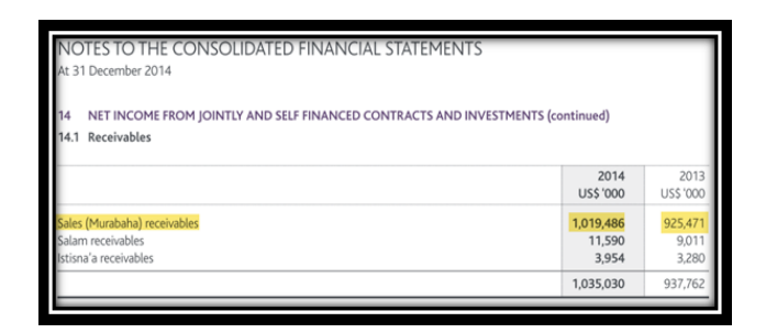
Fig 7: ABG- Income from Murabahah

standards becomes subject to scrutiny. However, these guidelines have not been enforced and penetrated in wider scale among IFIs across the globe in spite of AAOIFI's persuasion of its application in the global network. In relation to this, addressing the argument of should we separate the accounting standards for Islamic banking, this paper compares the divergence in accounting standards of AAOIFI as applied by Al Baraka Group (ABG) and IFRS as the basis of Bank Muamalat Malaysia Berhad (BMMB) through highlighting Murabahah facility.