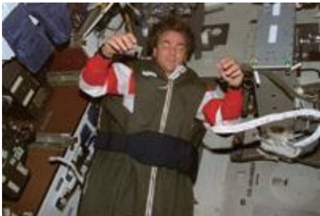
Fig. 1. The position of a sleeping astronaut in low orbit [http://iss.jaxa.jp/med/healthy_sleep_en.pdf]

During space activity in low orbit, astronauts had bad quality sleeps. This sleep position is not healthy due to microgravity effect in this area (9 m/s 2 ). The astronaut's arms would go up and forward and at the same time, losing strength as shown in Fig. 1.