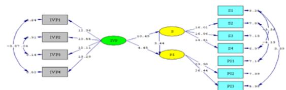
Figure 2. Model Test Analysis

From the analysis of the suitability test, all tests showed good compatibility including ECVI, AIC, and CAIC, Fit Index, while Chi-Square, RMSEA, Critical N and Goodness of Fit showed marginal fit. It can be concluded that the suitability of all models meets the requirements (goodness of fit). Furthermore, this research produces the T-Value path diagram (see Figure 2)