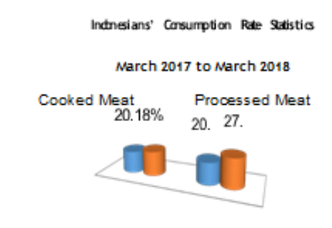
Figure 1. Ratio Indonesian consumption rate from March 2017 to March 2018

of protein source has a familiar Indonesian market such as contains a highest fat and cholesterol amount. Therefore, to encourage the consumers to choose duck as a frozen food, the reducing fat amount and its smell is proposed in the PT. BEFINDO FOOD. In addition, PT. BEFINDO FOOD needs to improve and develop an innovation over food production process (see Figure 1) [1].